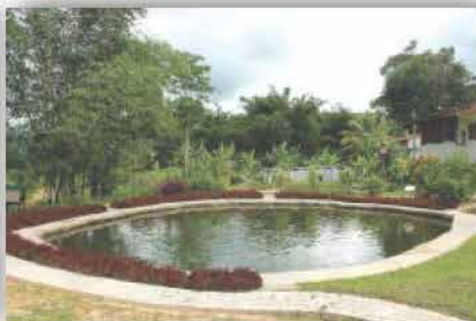
(The labour and the fruit of their labour above)